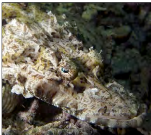
Nocturnal Frog Fish and Crocodile Fish