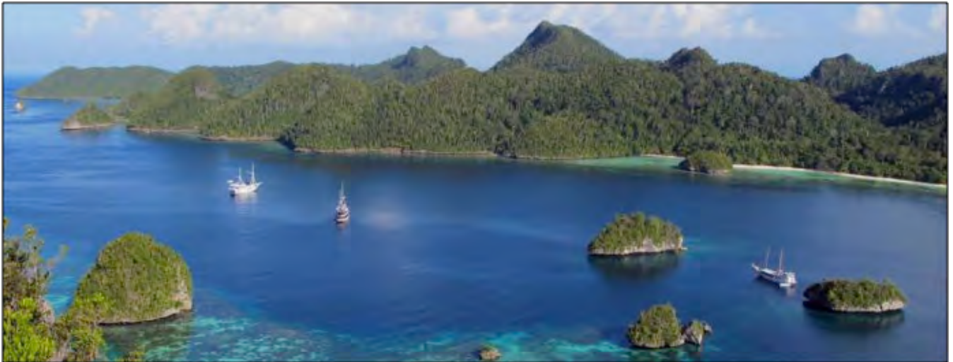
Overlooking Raja Ampat Marine Park

Living in Asia has some key advantages and being located in Malaysia has the added benefit of being located on the edge of the coral triangle and with low cost travel now makes some of the most remote scuba diving locations easily accessible.