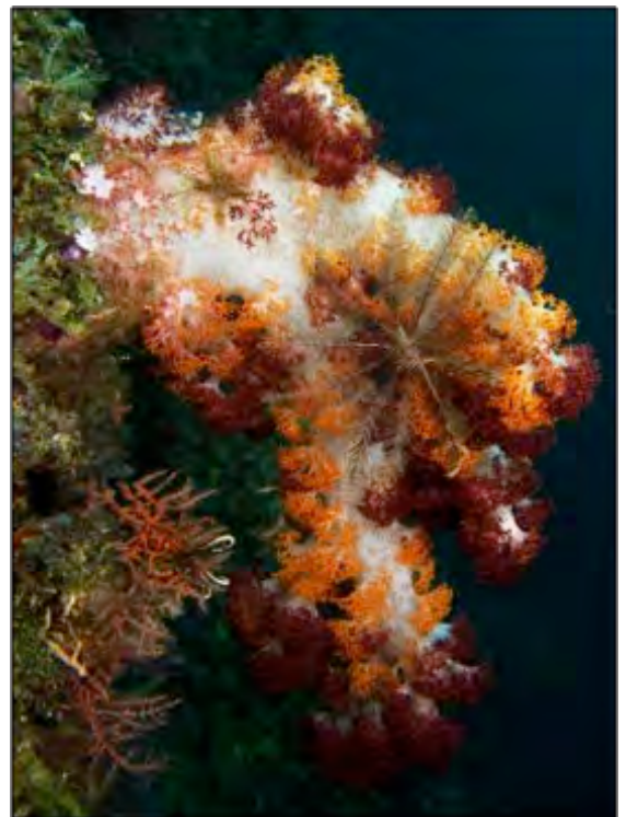
Tricolour Soft Coral

As the sun goes down everyone prepares for their first night dive which can be intimidating at the best of times with being new to the area and changing currents some of us were a bit hesitant but the excitement of what was to be discovered overcame any hesitation quite quickly.