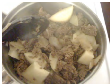
Stovies cooking on the stove